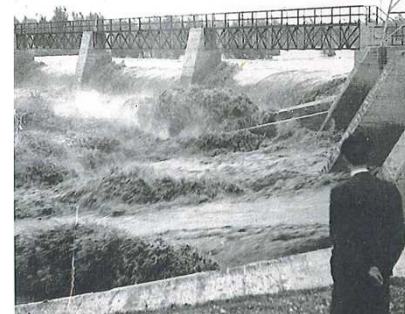
Figure 6. 1937 flood.