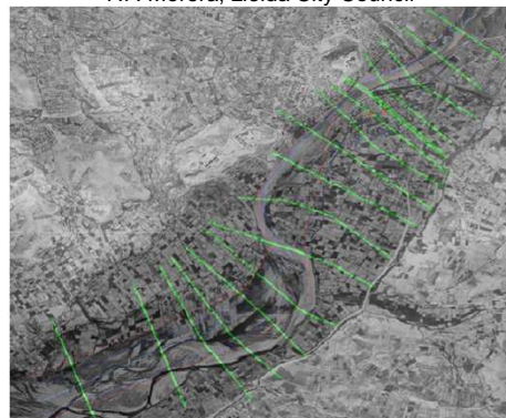
Figure 4. Modelled reach with the 18 cross section over the digital elevation model