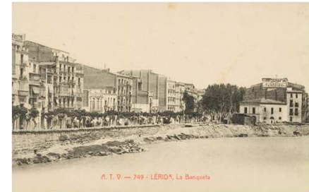
Figure 8. Upstream view of Lleida and the Segre from the Old Bridge in 1910.