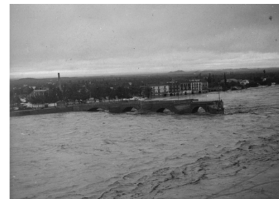
Figure 5. Old Bridge destroyed by 1907 flood.