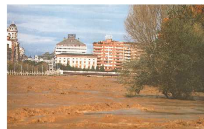
Figure 7. 1982 flood.