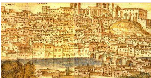
Figure 3. Detail of a drawing of Lleida in 1563 by artist Anton van den Wyngaerde, with the Segre River, the Old Bridge and the houses by the river.