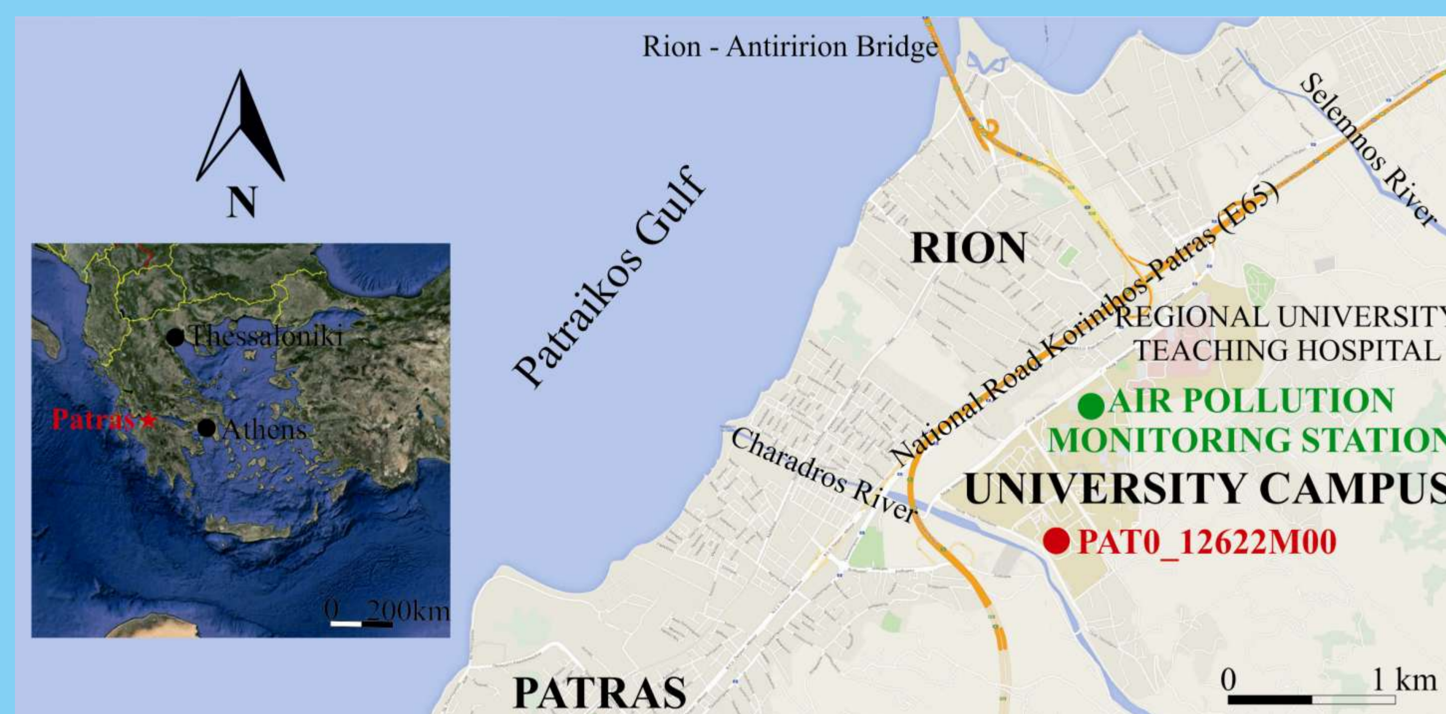
Figure 1 Map of major Patras area.

GPS measurements (EUREF - PAT0_12622M00) by a station installed at the University of Patras Campus (Fig. 1) with a 30-s sampling rate were processed. Coordinates of a 3-h interval and zenith tropospheric delay with a 30-s interval were computed using the PPP algorithm provided by the CSRS online PPP service of the Natural Resources of Canada [2].