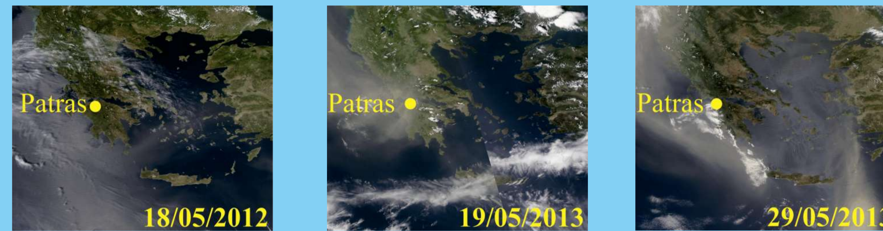
Figure 2 Satellite images from MODIS showing Sahara's dust events over Patras

The PM concentrations are available from the Air Pollution Monitoring Station of the Environmental Engineering Laboratory installed in the same area. For the present work, the period from 01/05/2013 to 15/06/2013 was selected because of the two episodes of Saharan dust occurred during this period (Fig. 2).