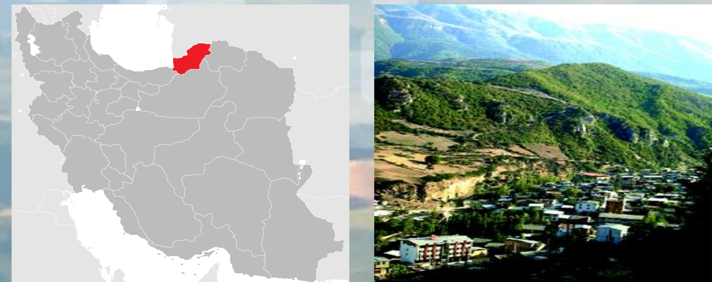
Figure 1. Study area and the site of the sampled area showing deforestation

Key Words: Deforestation, Multivariate Statistical Methods, PLS, Soil Degradation, Northern Iran