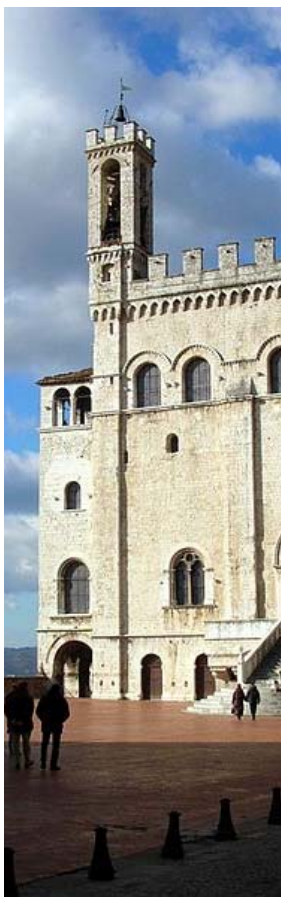
Consoli Palace Gubbio