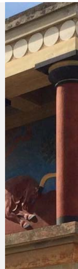
Palace of Knossos