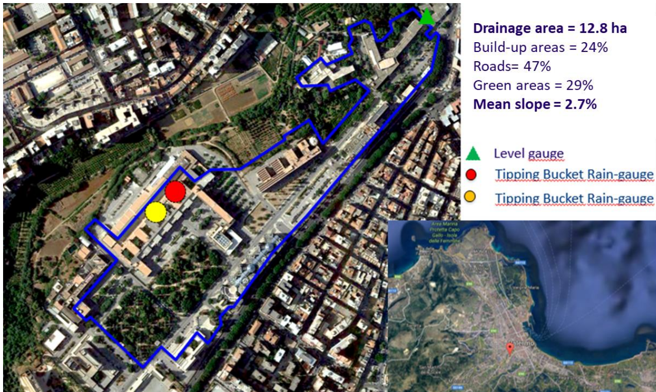
Figure 1. The Parco d'Orleans case study.

For rainfall-runoff transformation in the urban drainage system, a conceptual model for urban catchment, which incorporates semi-distributed modelling concepts has been used (Aronica & Cannarozzo, 2000). The urban basin is divided in external sub-catchments connected to the drainage network. Each external subcatchment is modelled as two separate conceptual linear elements, a reservoir and a channel, one for the pervious part, the other for the impervious part of the investigated area. The drainage network is schematized as a cascade of non-linear cells and the flood routing is simplified in the form of kinematic wave and represented as a flux transfer between adjacent cells. The sensitivity of this rapid response system to the accuracy of the rainfall input has been studied with reference to drainage failures and urban flooding issues.