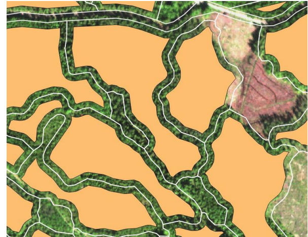
Original stands (white) were downsized with 10-meter buffer (orange) before calculating the zonal mean reflectances to avoid spectral mixing.