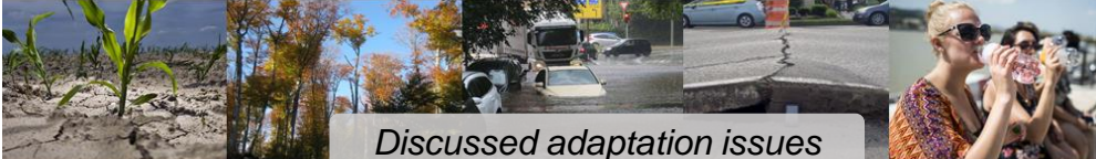
Discussed adaptation issues