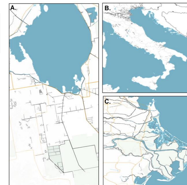
Identified raised defences (black) for (A) Florida, US, (B) Italy and (C) Po region of Italy.