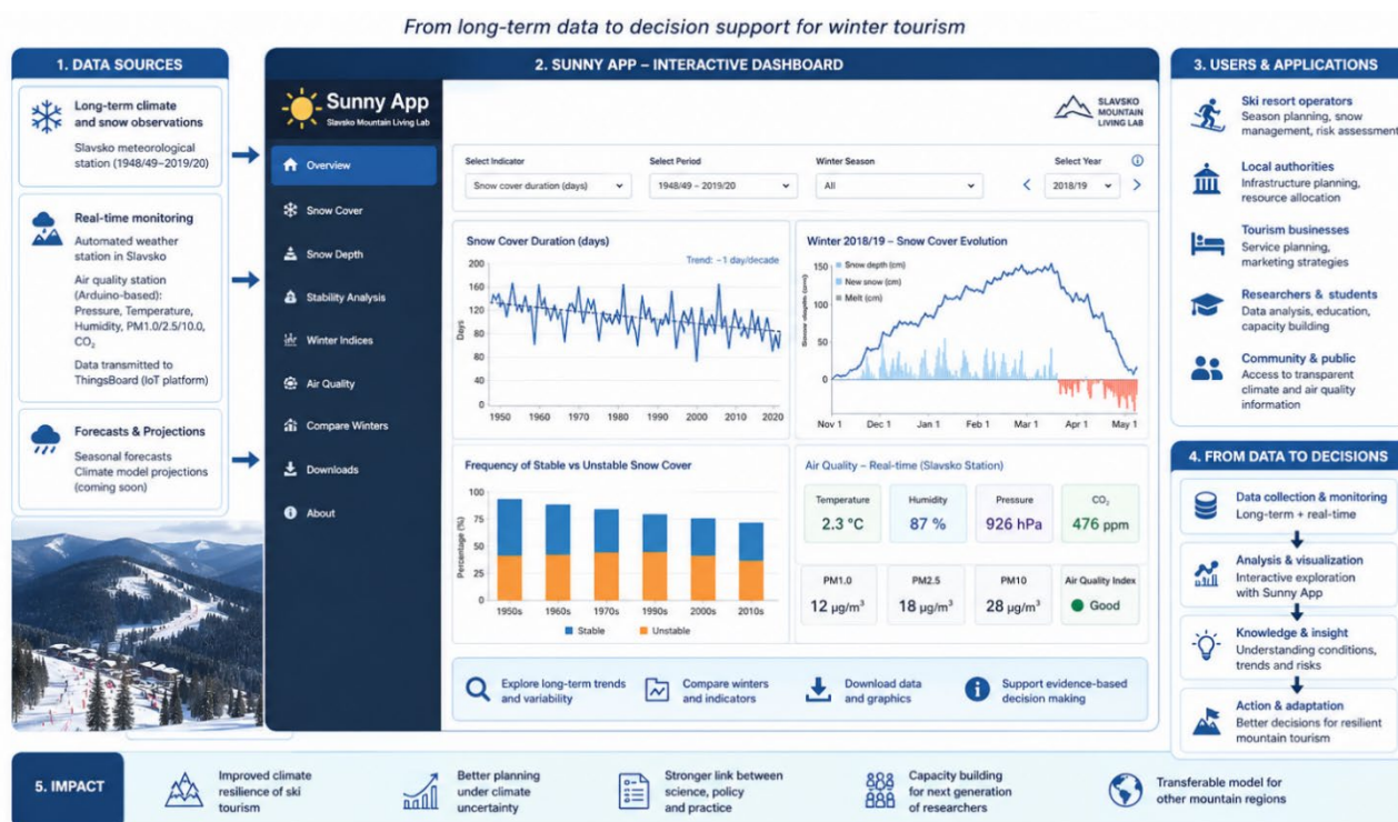
Figure 3.1 – Conceptual Design of an Application for an Interactive Climate Service in a Mountain Ski Living Lab (Blueprint)

To support the practical use of these data, an interactive application has been developed using Shiny (R). This tool allows users to visualise and explore climate and snow data in an intuitive and flexible manner. By enabling the comparison of different winters, the exploration of variability, and the interpretation of snow stability conditions, the application transforms static datasets into a dynamic decision-support environment. It also enhances transparency by allowing stakeholders to directly engage with the underlying data rather than relying solely on expert interpretation.