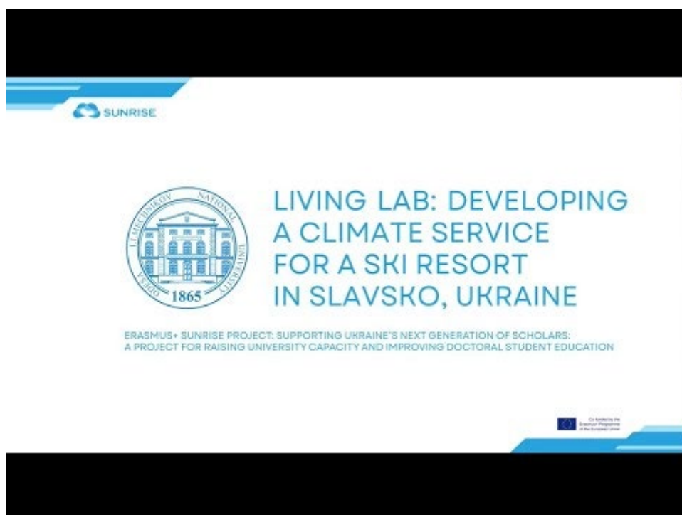
Video 3.1. – From Lab to Field: Installing an Arduino-Based Air Quality Monitoring Station in Slavsko