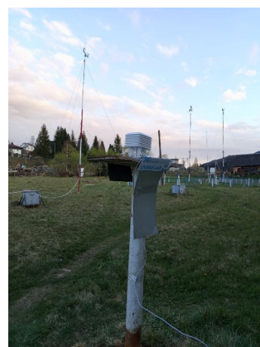
Figure 3.2 – Photographs of the Arduino-based air quality monitoring station installed at the Slavsko meteorological station