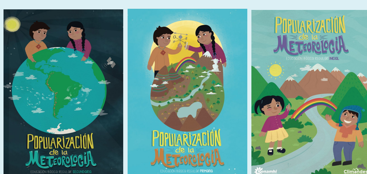
Educational material developed to popularize meteorology and climatology in school