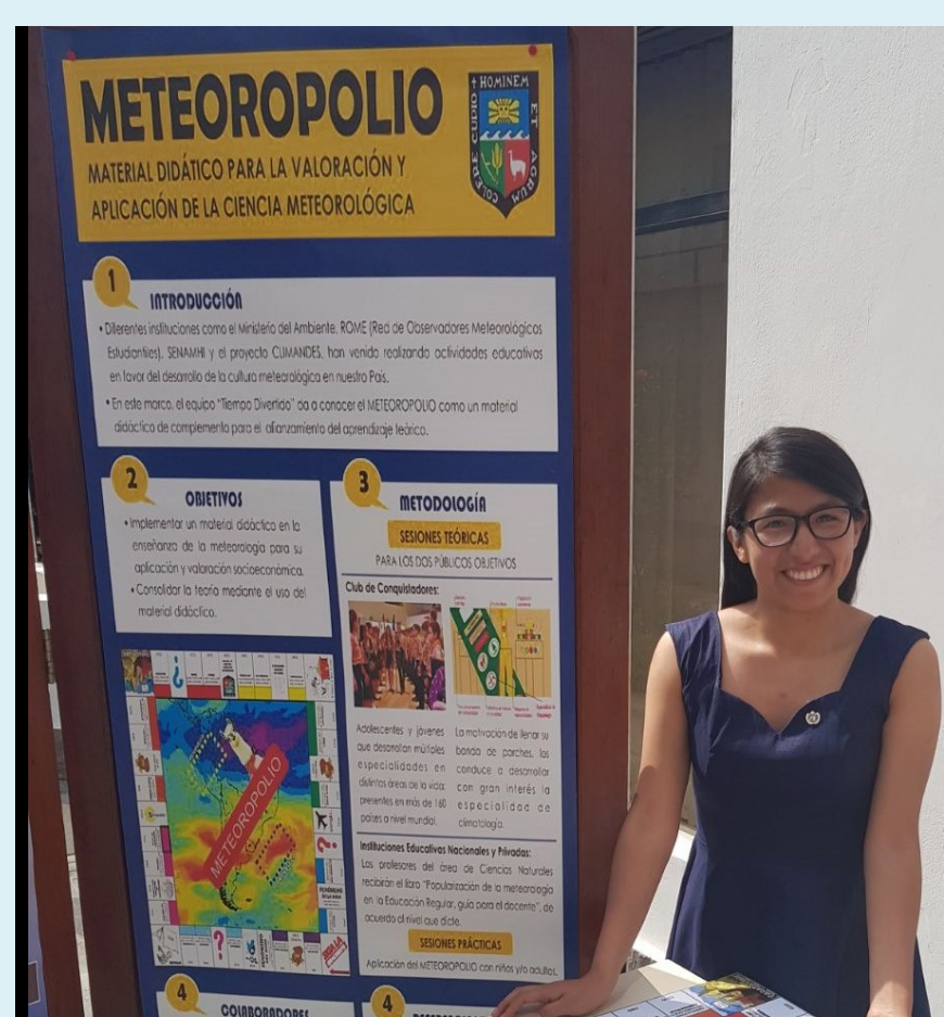
Supporting students in scientific projects and the development of their thesis