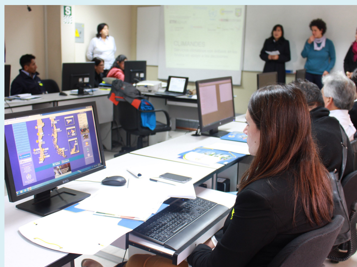
Conduction of blended courses for professionals and students from RA-III