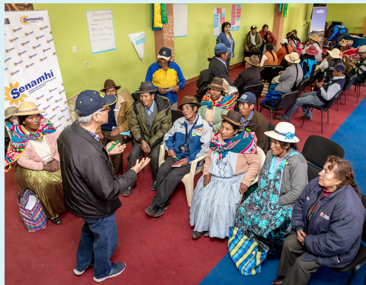
Farmer fields schools to improve the understanding of end-users on climate information