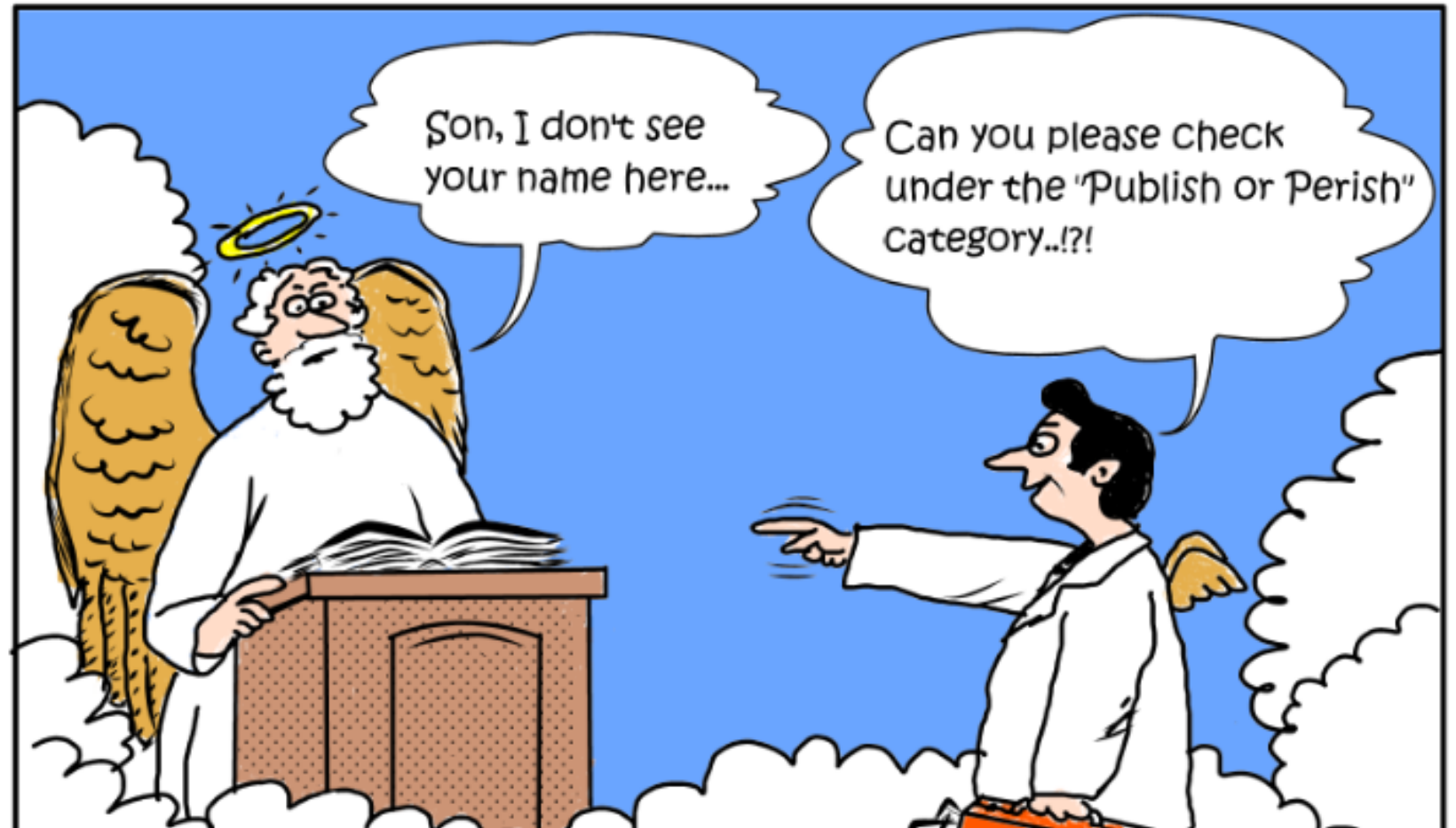
Image from https://www.linkedin.com/pulse/publish-perish-can-we-choose-one-category-please-de-moraes