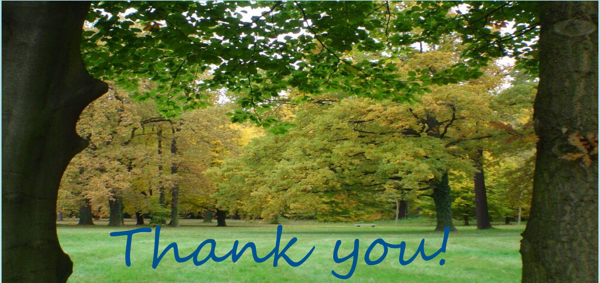
Image from http://old.saao.ac.za/~pah/Berlin%20Pictures/forest_1.jpg