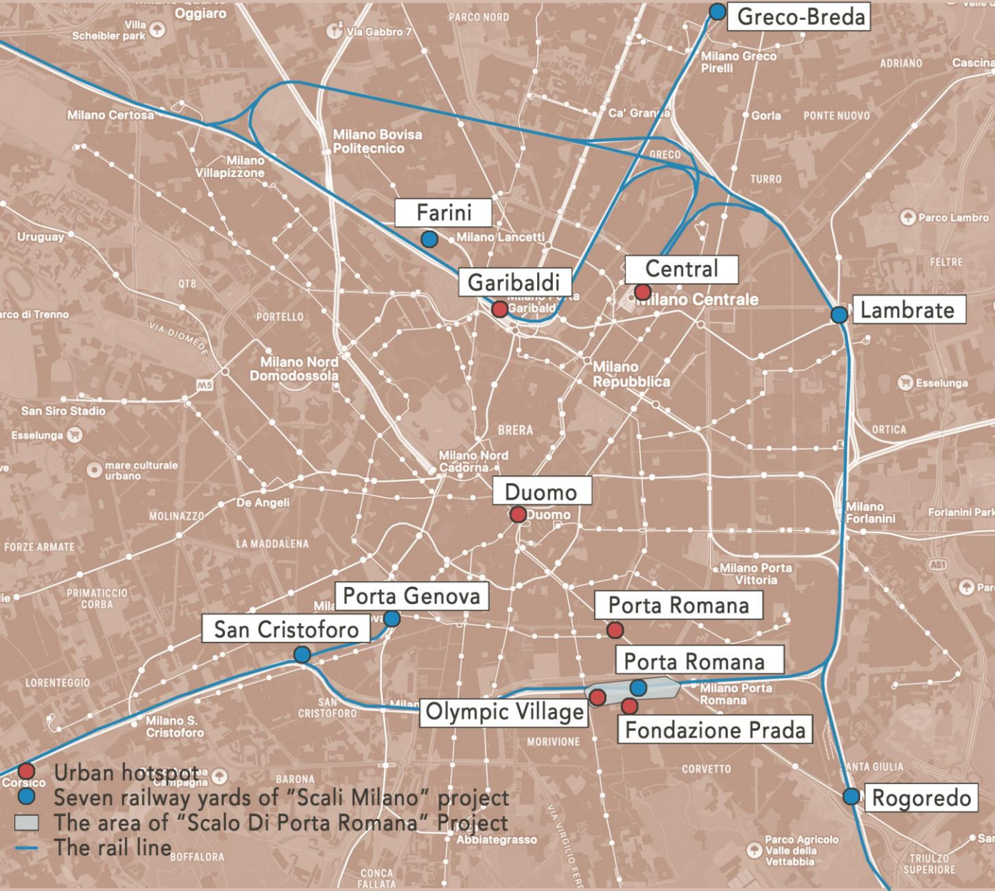
Fig. 1 Layout of Railway Yards and Urban Structure in Milan.